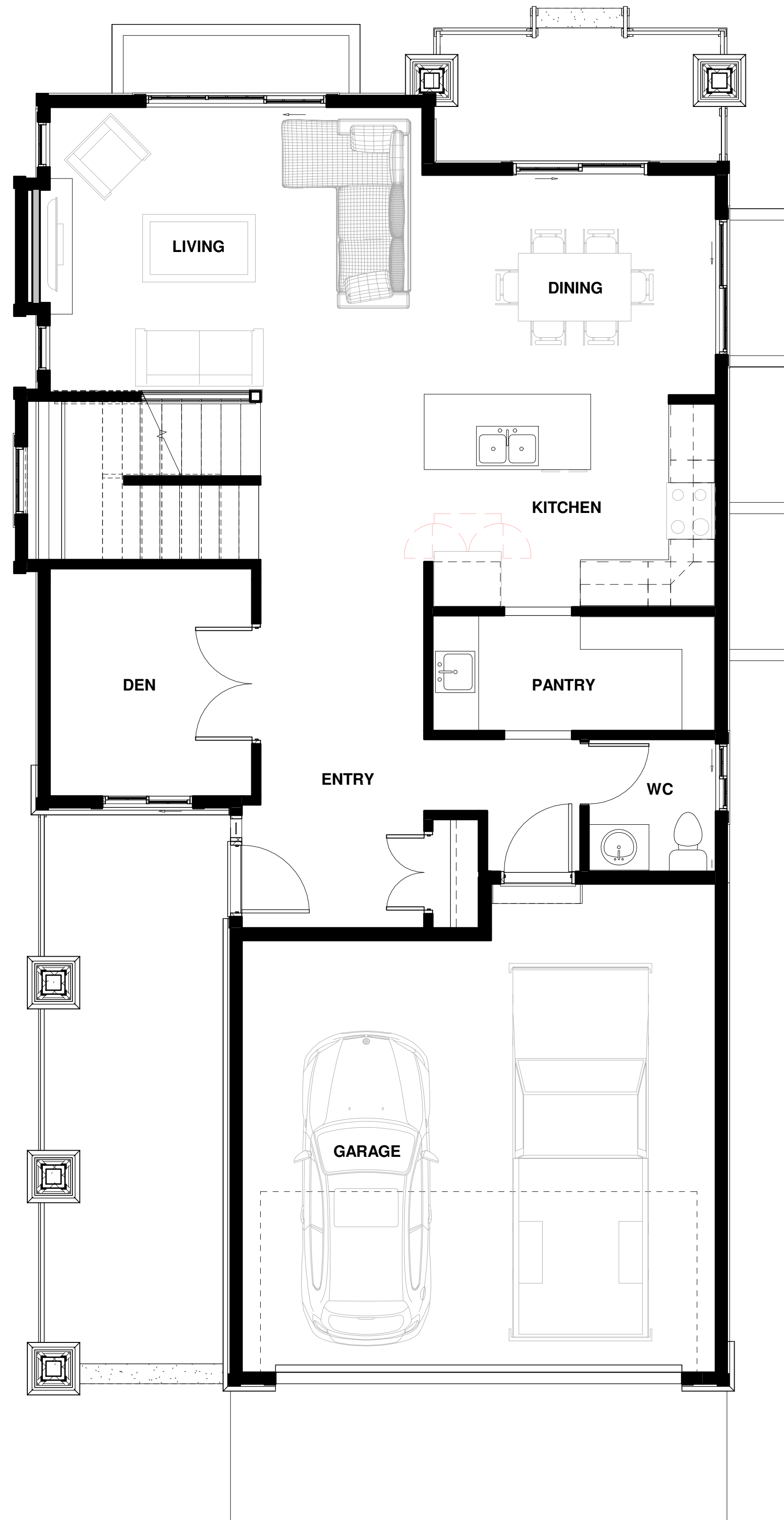
2 MAIN FLOOR PLAN SCALE: 1/4" = 1'-0"